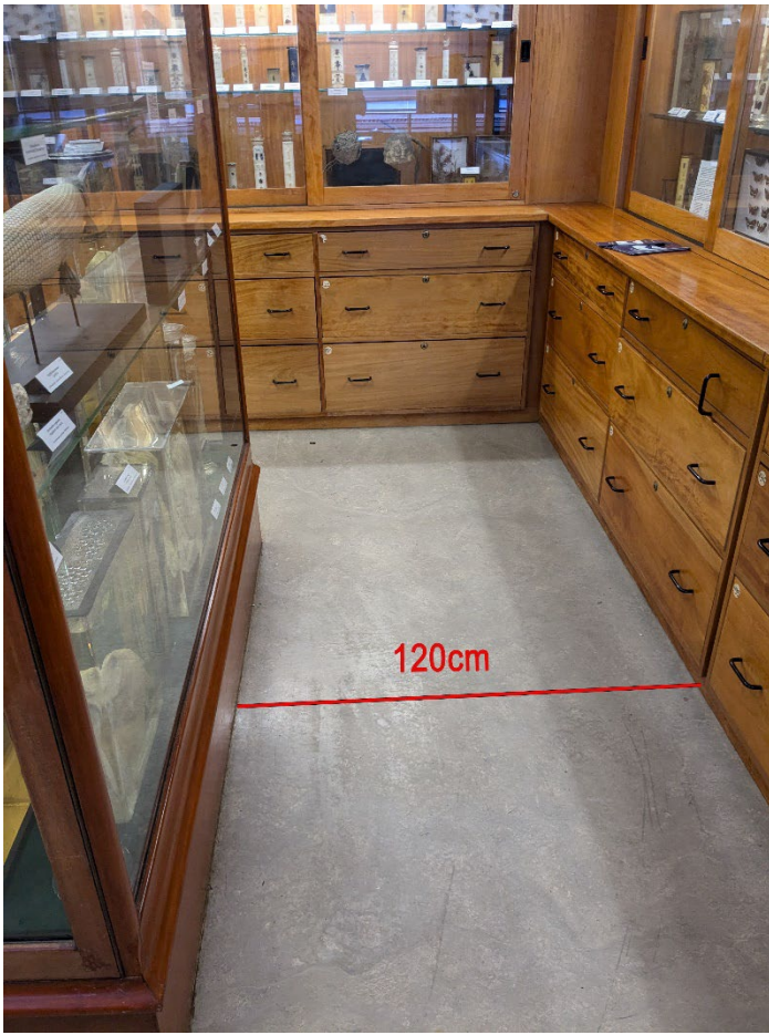
Far left gangway between central cabinet and wall