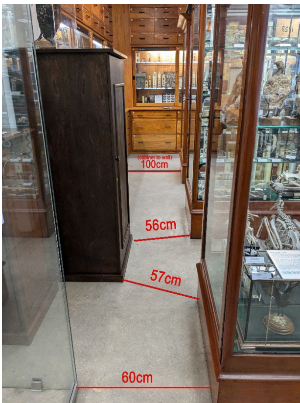
Gangway left of museum entrance - the narrowest point in the museum