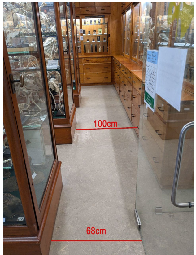
Gangway right of museum entrance