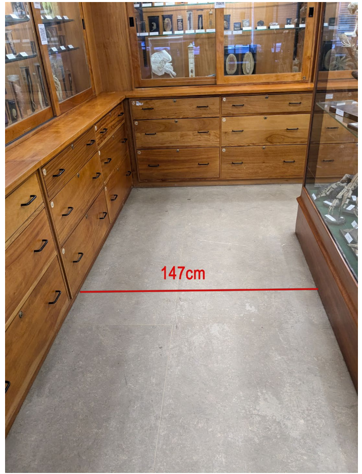
Far right gangway between central cabinet and wall