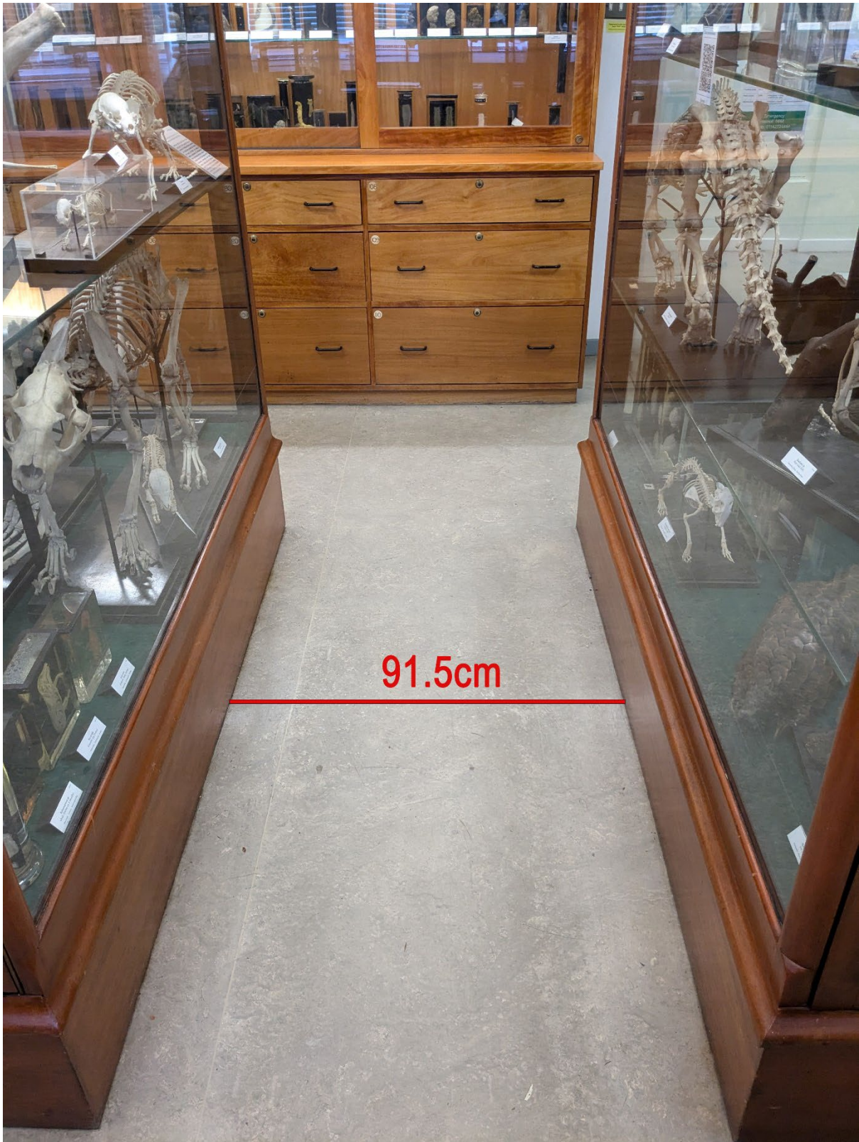
Space between central cabinets