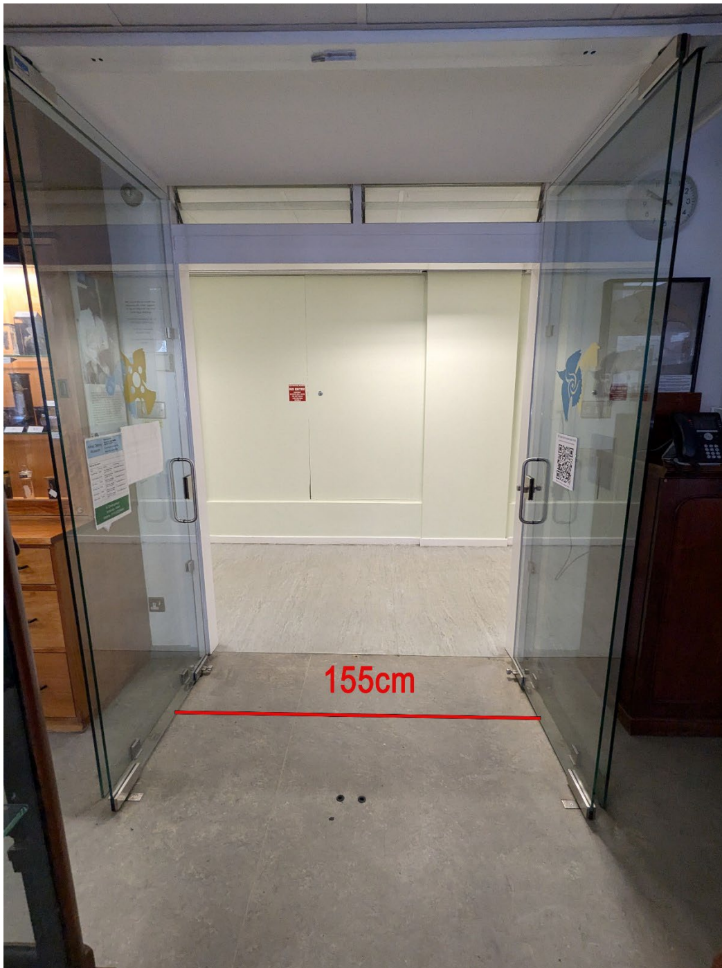
Entrance to the museum with both doors open

Below are photos of the spaces in the museum with measurements: