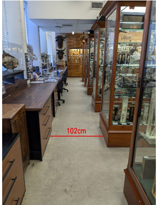
Outer gangway around central cabinets