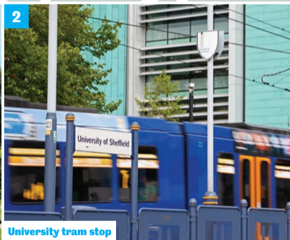
University tram stop