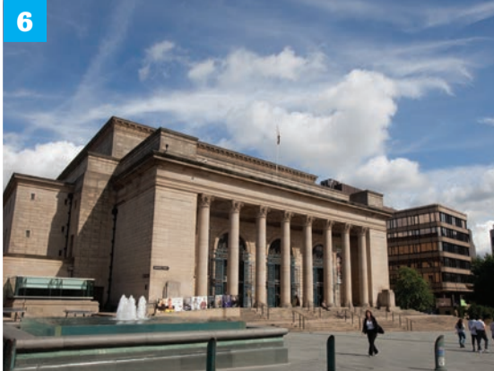
Barker's Pool & City Hall