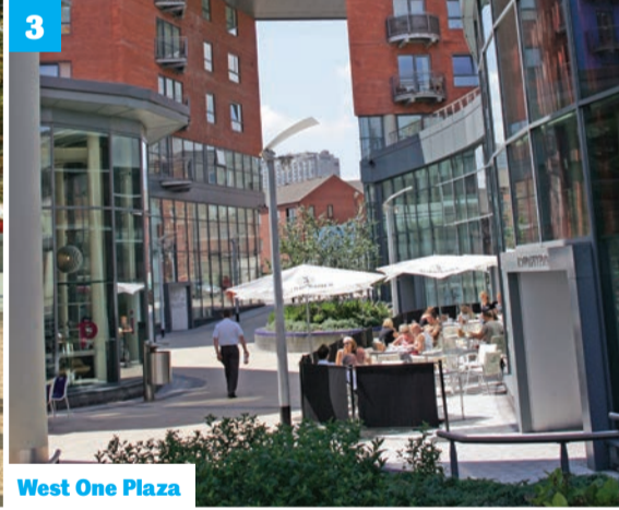
West One Plaza