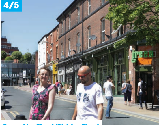
Devonshire Street/Division Street