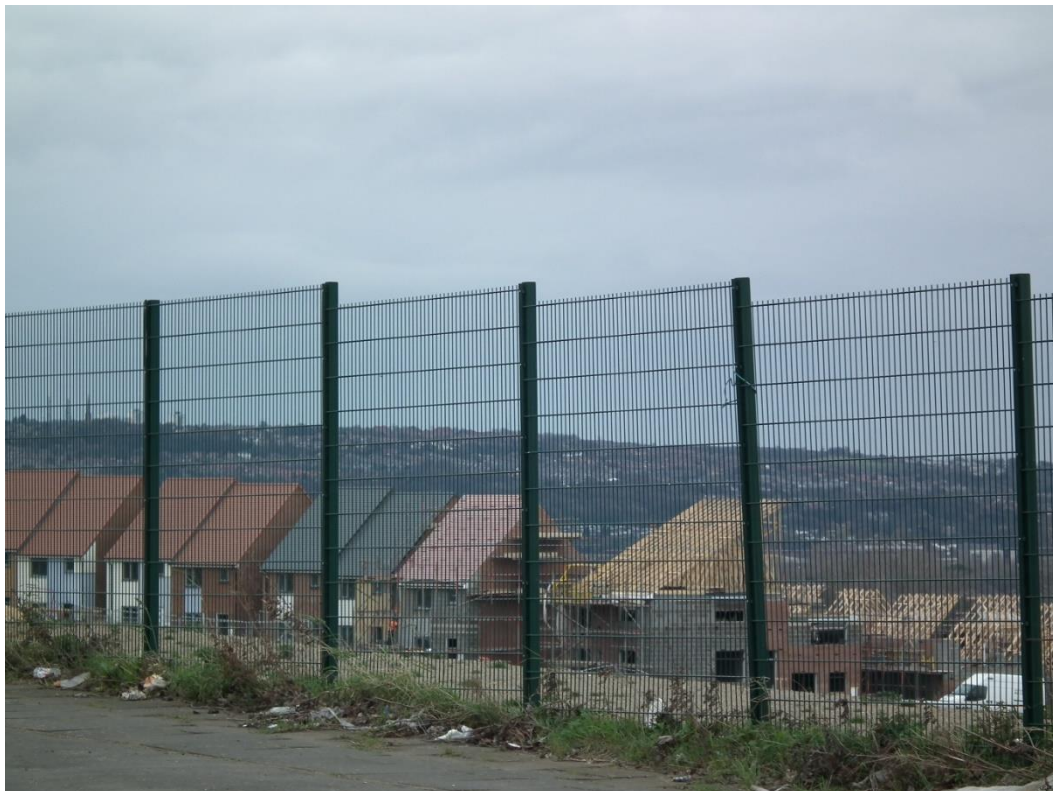
The Rise. Photo by Fred Robinson, 2015

Doubts about the feasibility of a 'repopulation' strategy, which had been expressed by the Audit Commission (2003) seem to have been borne out. As it turned out, demolition—difficult enough—was easier to achieve than development. Redevelopment was severely hampered by the recession from 2007/8. The New Tyne West Development Company, a public-private partnership between Newcastle City Council, Barratt Homes and Keepmoat Homes, has only slowly got going. At 'The Rise' (Figure 2) the new housing development being built by this Company on a huge cleared site at Scotswood, only 155 houses had been bought or reserved by the end of 2015.