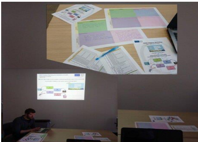
Figure 2. SWOT Analysis Workshop with Water Research Group

This tool enables any users around the world to match on-site pollutant discharges with a suitable locally sourced media, which could potentially be used by an engineer to mitigate such losses in an engineered structure placed at the delivery point of said discharges (Section 1.1).