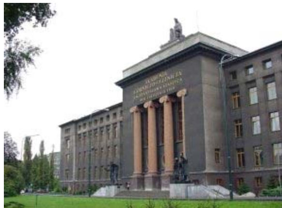
AGH: building A-0 - the venue of the workshop