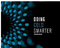
By the Cold Commission